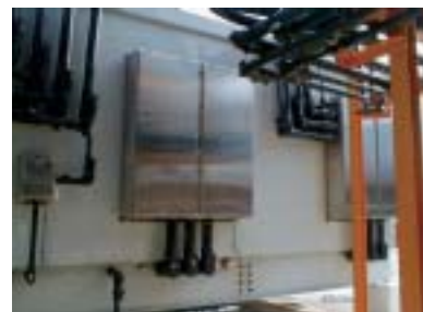
Conduit marshalling box