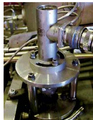
Rotary Variable Differential Transformer